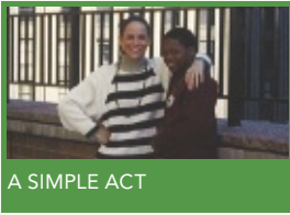
A SIMPLE ACT