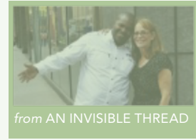
from AN INVISIBLE THREAD

In this lesson, you will read and compare “A Simple Act” and an excerpt from An Invisible Thread . First you will complete the first-read and close-read activities for “A Simple Act.”